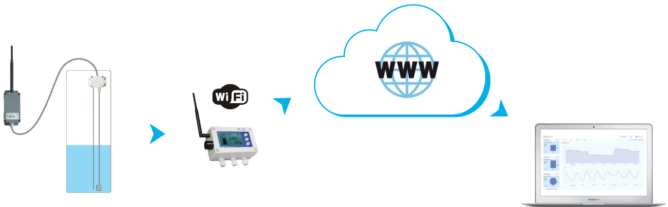
NAVIS tank level sensors

Level LiveData Basic, Level LiveData Advanced