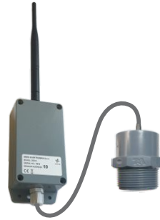
SU11 - 6/4" ULTRASONIC LEVEL SENSOR