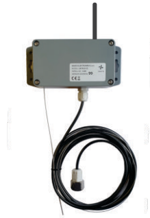
SC10 - CAPACITIVE LEVEL SENSOR