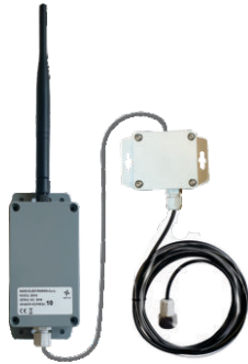
SC10/R - CAPACITIVE LEVEL SENSOR