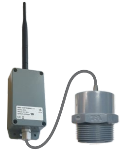
SU12 - 2" ULTRASONIC LEVEL SENSOR