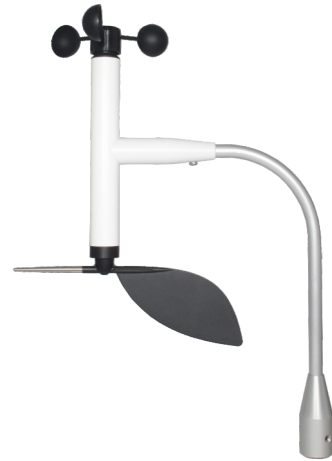
WSD 010-1 (standard range WSD sensor) WSD 011-1 (extended range WSD sensor)