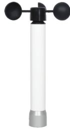
WS 010-1 (standard range WS sensor) WS 011-1 (extended range WS sensor)